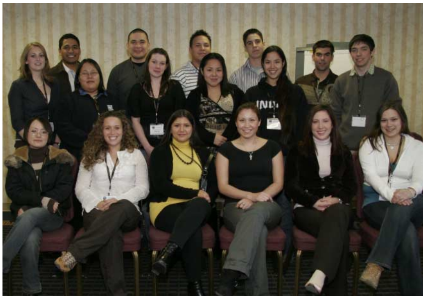
Aboriginal Youth Round Table Participants

Listed here are the generous sponsors who have lent their name to scholarships in the 2006-2007 fiscal year. The Foundation reviews scholarship and bursary applications and matches recipient and sponsor accordingly. Sponsors are notified of recipient names and financial contributions which are also made public on the Foundation’s website. Student recipients are listed on the pages that follow.