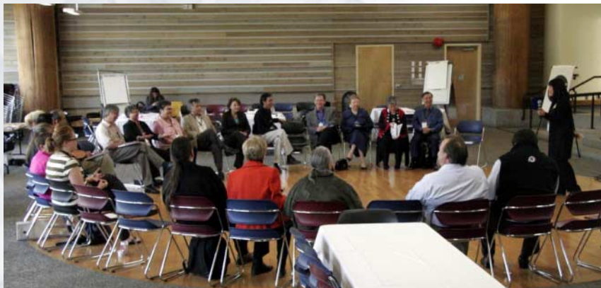
Kenny Family Foundation: Thinktank on Aboriginal Education