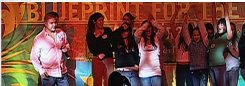
Participants: BFF Yellowknife