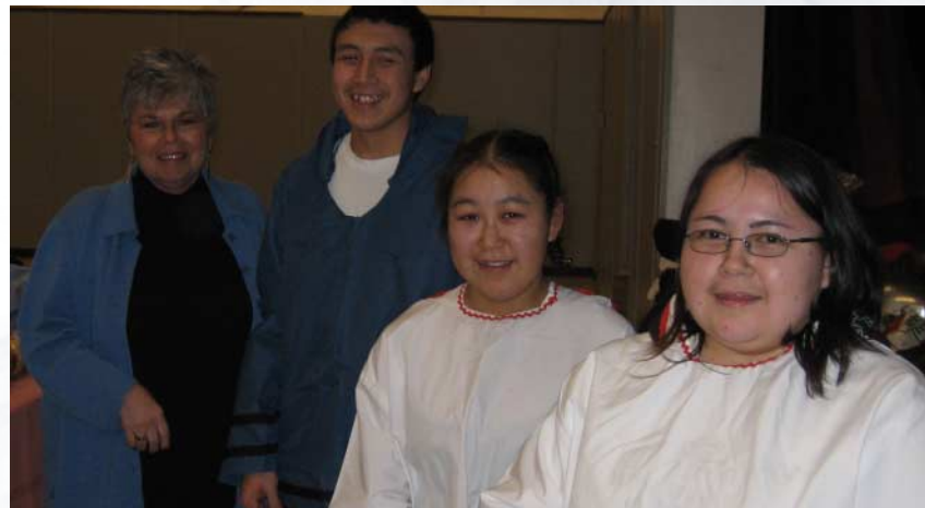
Eastern Arctic Tour: Inuit Dancers