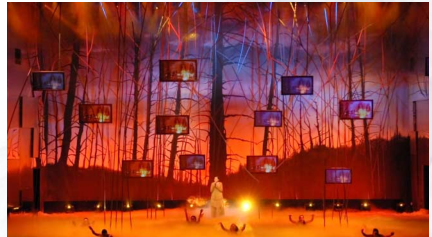
Set – 2007 Achievement Awards