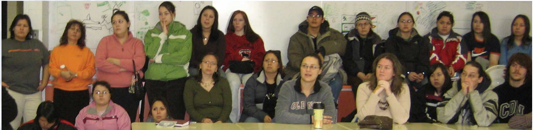
Participants: Arctic Tour Community Outreach